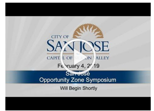
San Jose Opportunity Zone Symposium, February 4, 2019