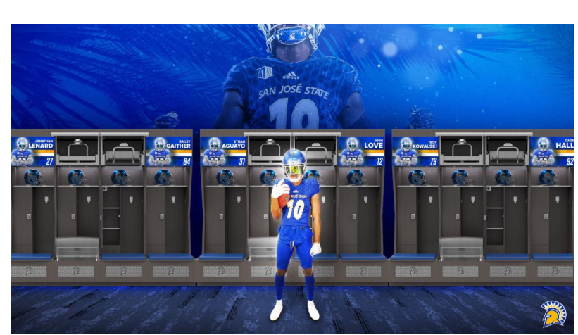
Graphic of locker layout in Spartans Athlentic Center

Sounds and will be impressive. When construction concludes in 2023, it will house locker rooms for football and soccer teams; a 150-seat auditorium; coaching offices; positionspecific classrooms; stadium game-day suites; a general