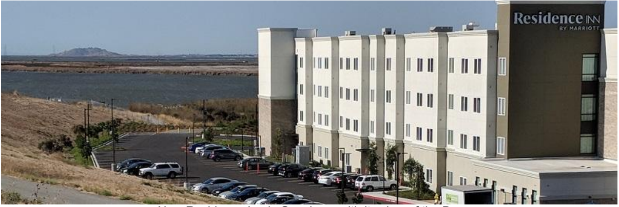
New Residence Inn in San Jose, with its view of the Bay

Two new Marriott properties are now open in North San Jose's Alviso area - Residence Inn and Fairfield Inn & Suites. Located at 656 America Center Court, the facilities represent an added 261 rooms to San Jose's hotel-hungry landscape.