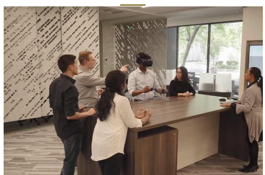
Demonstration of augmented reality technology at the Rockwell Automation facility in San Jose