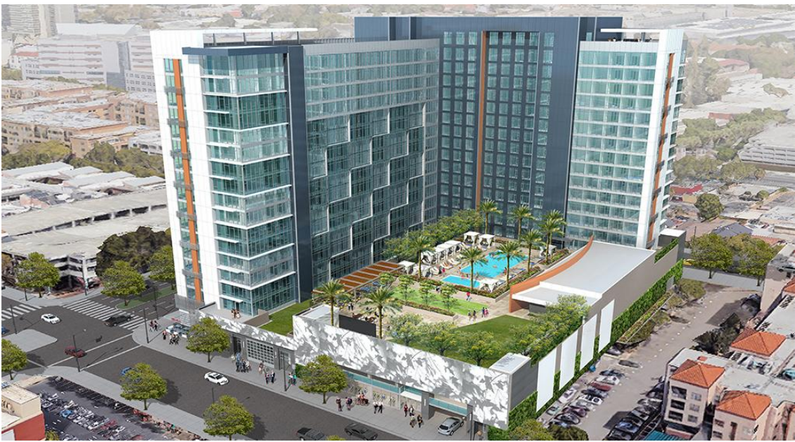
Rendering of The Grad development, looking north-east.