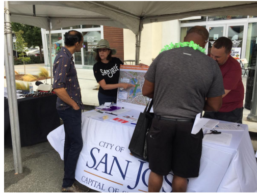
City staff at the pop-up info booth on the Google project, at Village Oaks community festival