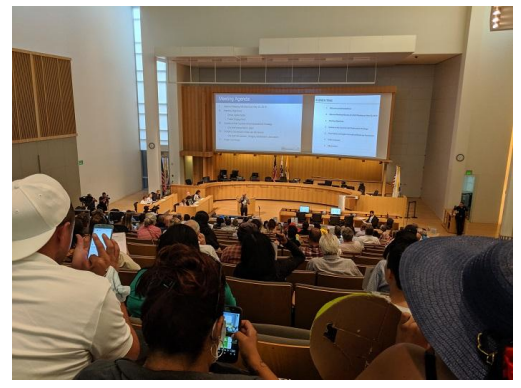
Full house in Council Chambers as SAAG meeting gets started 8/22