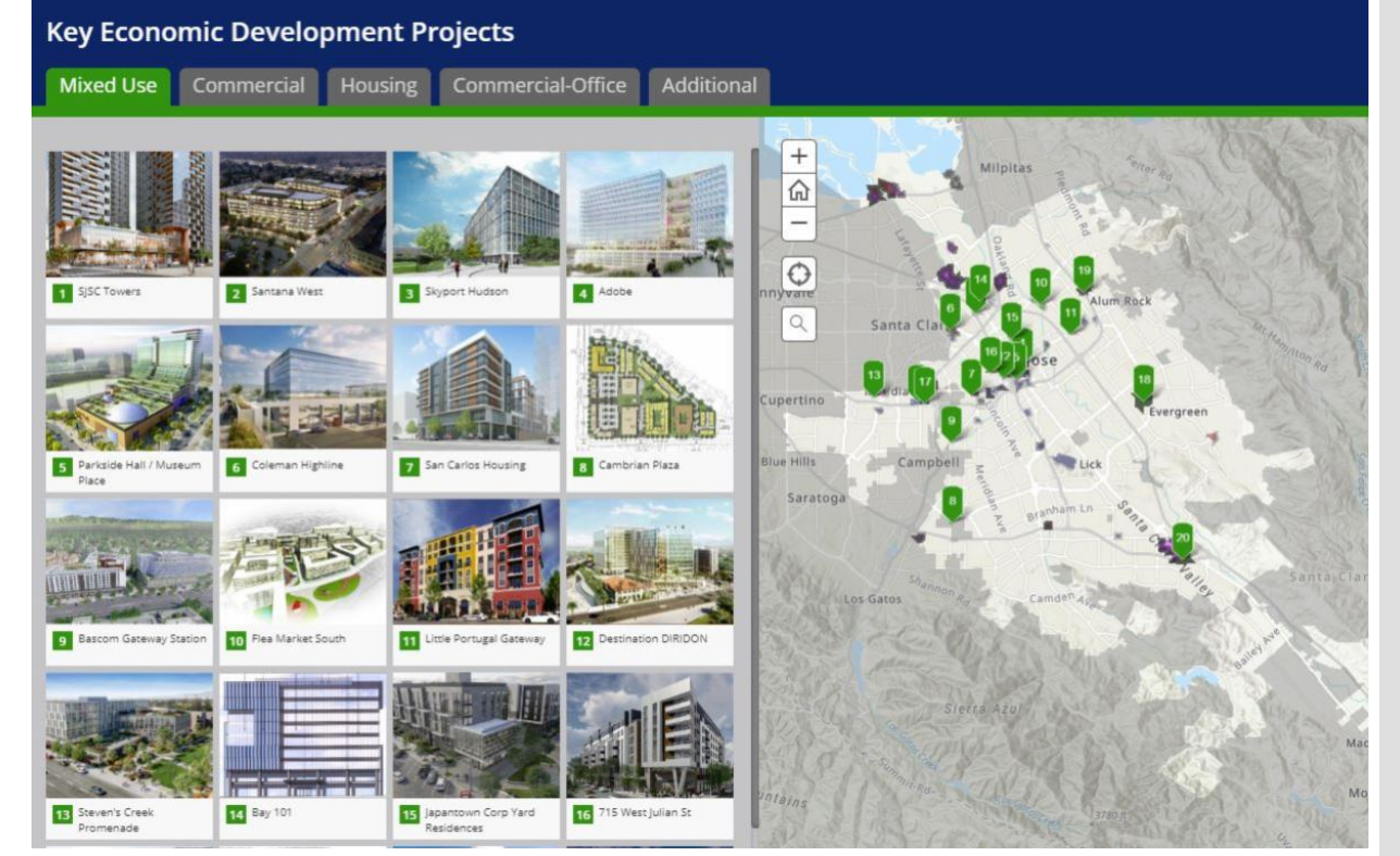
Screenshot of one view of the new San Jose project map

In addition to our Development Update Report, this month we are delighted to share a new feature, an <u>interactive map of San Jose development projects</u>, that incorporates links to Google satellite maps to see street view images of the project site, and a link to SJPermits.org to get more information on any of projects, including the permit status and site information.