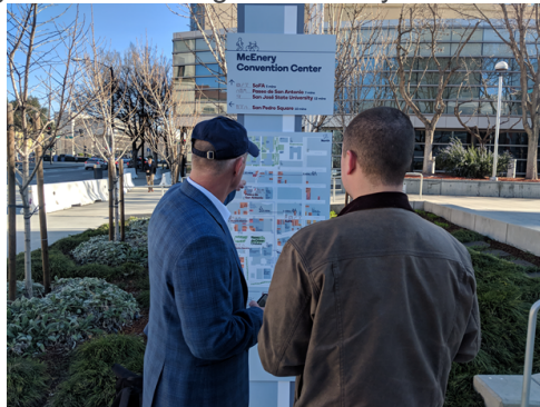
A mock-up of the information to be provided on wayfinding "totems" placed throughout Downtown San Jose, being tested outside the Convention Center in January, 2019.

A recent presentation to the Community & Economic Development Committee of the City Council provided the background to our wayfinding initiative that includes working jointly with the members of the Metropolitan Transportation Commission on aligning Bay Area wayfinding initiatives. In the blogpost, we share how CityID , one of the world's leading urban design firms, is helping make Downtown easier and more fun to navigate.