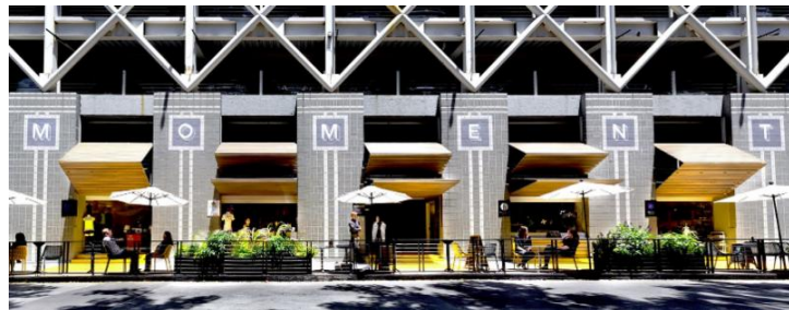
MOMENT at San Pedro Square

Enhanced by the addition of the MOMENT retail project, San Pedro Square has won an Award of Excellence in the category of Great Places from the Northern California chapter of the American Planning Association.