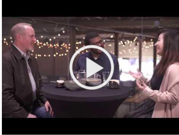
Resident Roundtable: Life and Work in San Jose

After helping to create and share video essays on San Jose's essence and the city as a workspace, OED reached out to three individuals to share their personal experience living and working in San Jose. This third video, Resident Roundtable, focuses on three very different individuals, from different businesses and backgrounds, all living, working and making their marks in San Jose.