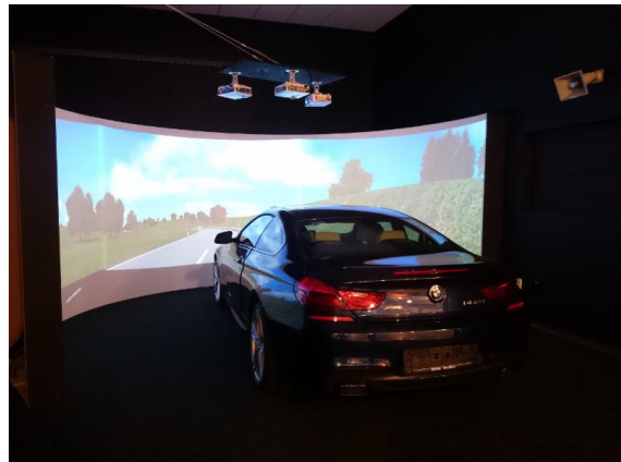
Driving simulation lab, ProspectSV