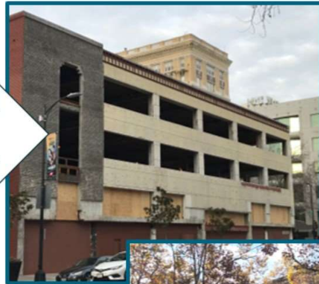
Former JC Penney – First & Santa Clara