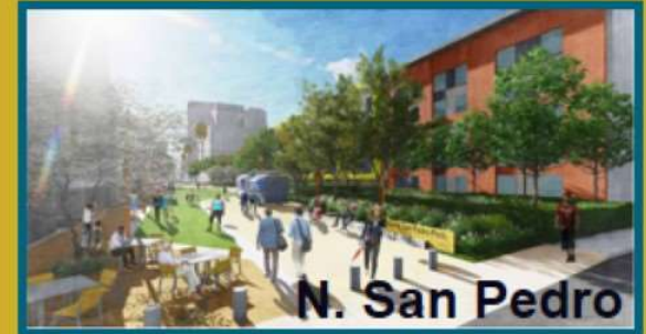
N. San Pedro