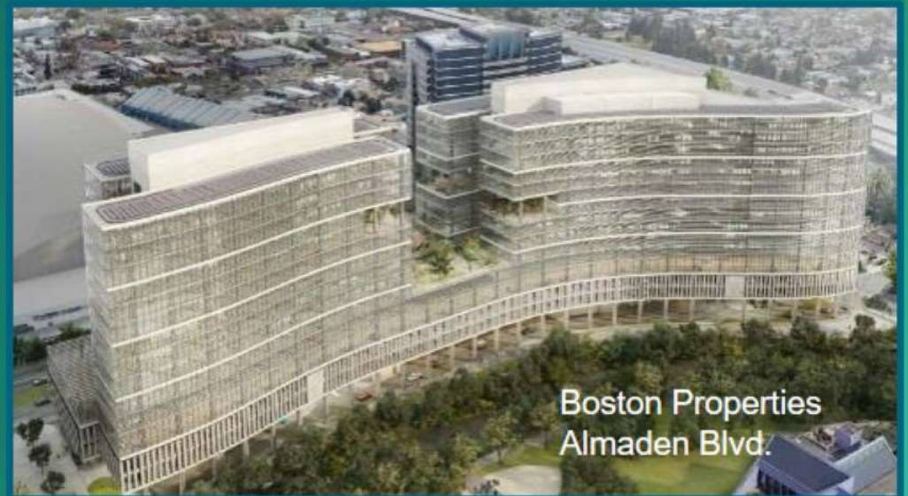
Boston Properties Almaden Blvd.