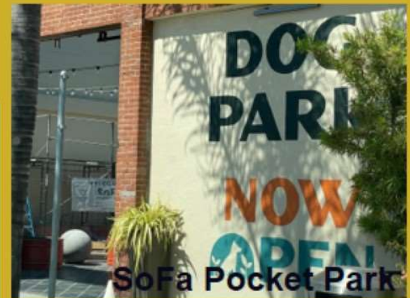
SoFa Pocket Park